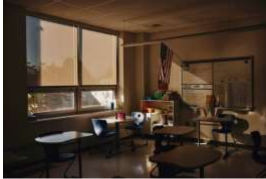
A classroom in Haverhill, Mass.

Any debate about fairness in school funding has to start with clear data, but it turns out that data can be very hard to find. Most people understand the inequity of school districts in wealthier areas having more money than those in less affluent communities. Addressing these disparities — across school districts — is important; but just as important, and less understood, is the unfair distribution of resources within school districts.