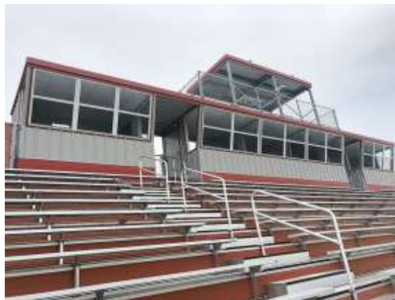
South Elgin has replaced its track, installed lights and put in a press box.