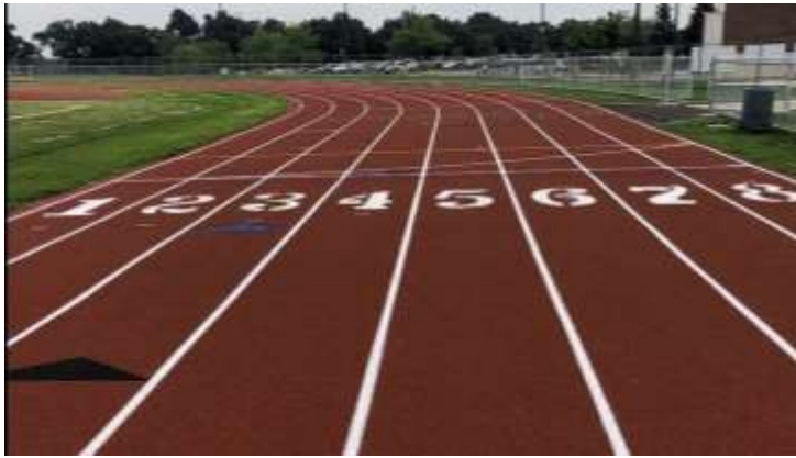
South Elgin has replaced its track, installed lights and put in a press box.

South Elgin football is ready for prime time.