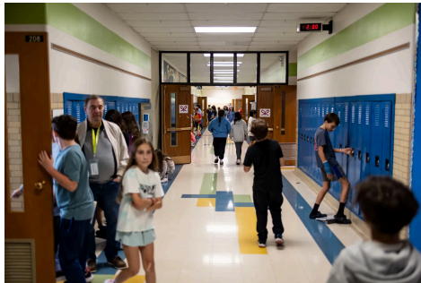
Students change classes, Oct. 29, 2024, at Lincoln Middle School in Park Ridge.

In addition to the Illinois Assessment of Readiness, or IAR, the Illinois Report Card also includes data from the SAT, an Illinois Board of Education-sponsored accountability assessment given to high school juniors.