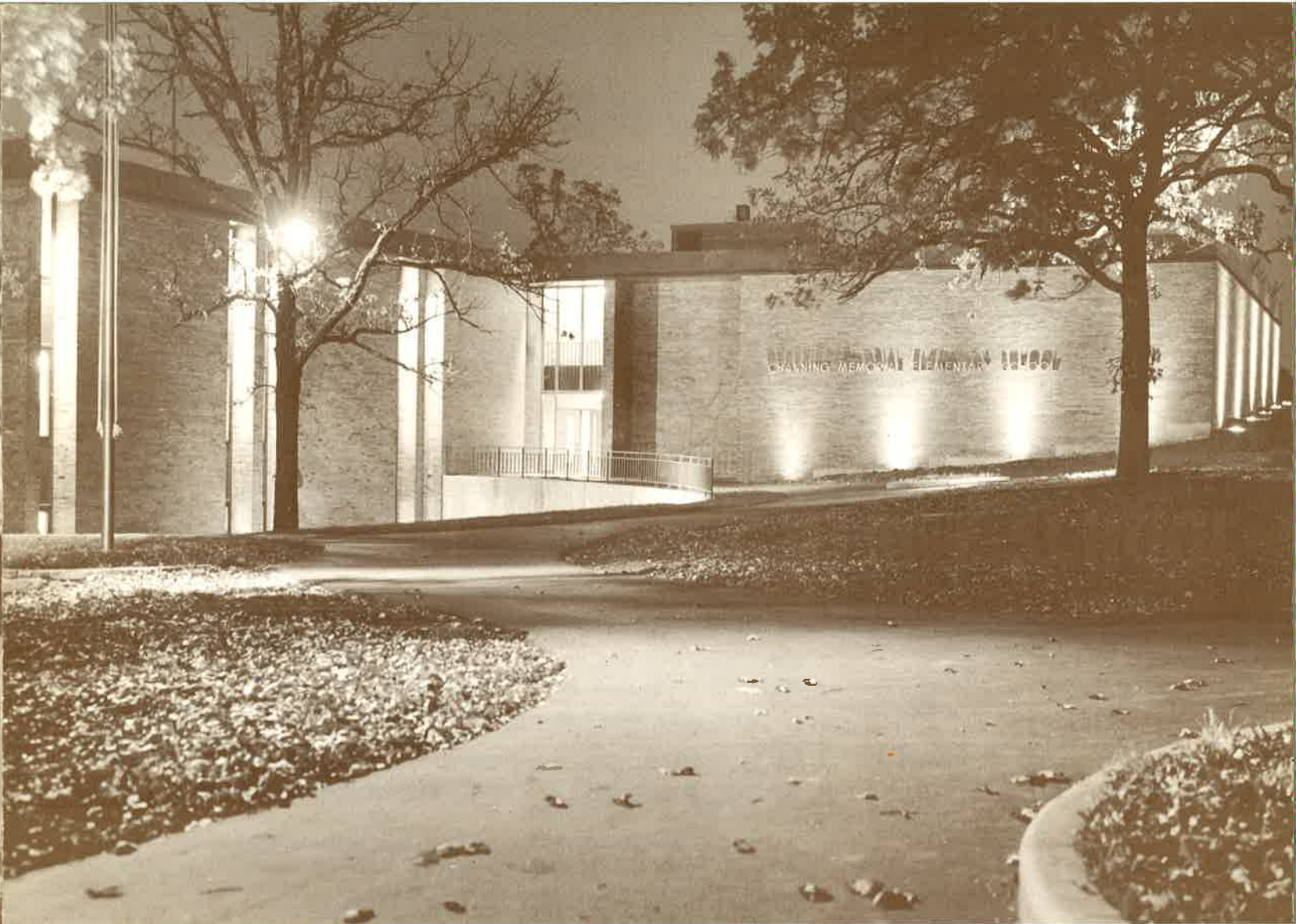
CHANNING MEMORIAL SCHOOL